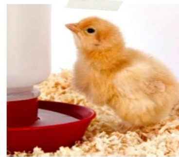
xiǎo jī hē shuǐ 小鸡喝水。